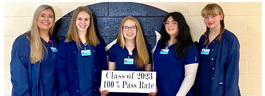
LOOP 2.0 Healthcare