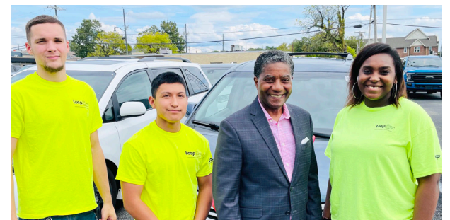
LOOP 1.0 Manufacturing

care), and LOOP 3.0 (JEA), a total of 31 JMCSS high school students are participating in career building and job placement opportunities this semester.