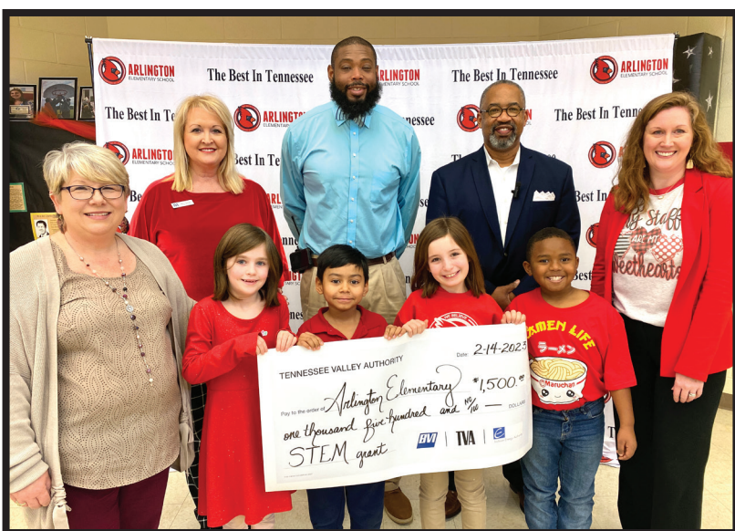
ARLINGTON ELEMENTARY $1,500 STEM GRANT

Through a competitive STEM grant process funded through Tennessee Valley Authority (TVA) and Jackson Energy Authority (JEA) , teachers from Arlington Elementary, Community Montessori, Jackson Academic STEAM Academy (JASA), and Rose Hill Elementary were awarded grant dollars to utilize within their classrooms. Over $1 million in grants was given to educators in public and private schools to develop science, technology, engineering and math education projects across the Tennessee Valley and TVA's seven state service territory. Congratulations, JMCSS teachers and students!