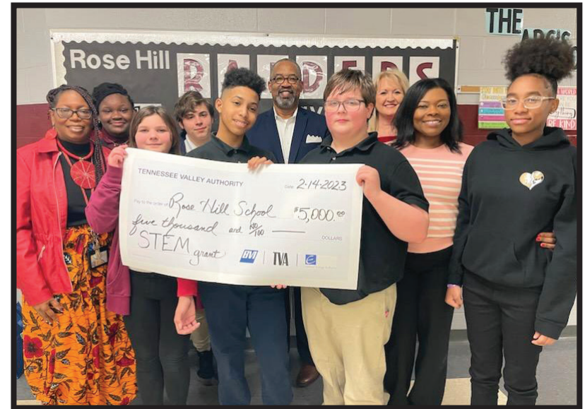
ROSE HILL SCHOOL $5,000 STEM GRANT

Through a competitive STEM grant process funded through Tennessee Valley Authority (TVA) and Jackson Energy Authority (JEA) , teachers from Arlington Elementary, Community Montessori, Jackson Academic STEAM Academy (JASA), and Rose Hill Elementary were awarded grant dollars to utilize within their classrooms. Over $1 million in grants was given to educators in public and private schools to develop science, technology, engineering and math education projects across the Tennessee Valley and TVA's seven state service territory. Congratulations, JMCSS teachers and students!