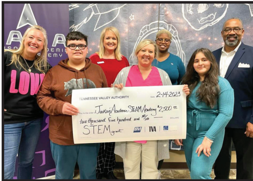
JACKSON ACADEMIC STEAM ACADEMY $2,500 STEM GRANT